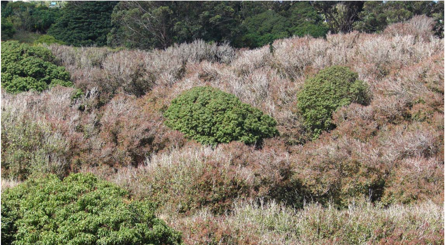
This copse of dead rose apple ( Syzygium jambos ) trees in Hawaii shows that eucalyptus rust is capable of killing adult trees.