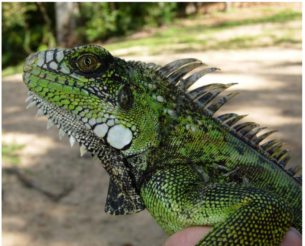
Caught! The pesky green iguana finally in safe hands.

Green iguanas are a significant quarantine concern for Australia, with escaped pets having formed feral populations in Fiji, Florida, Israel, Puerto Rico and other Caribbean islands. A very expensive eradication campaign is underway on two islands in Fiji.