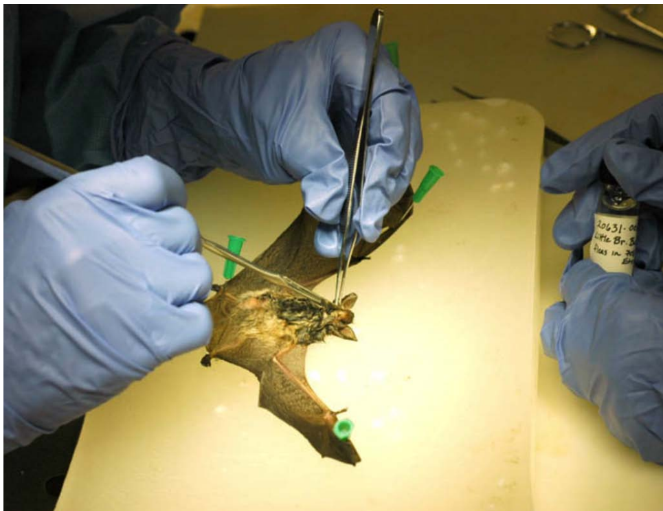
A bat with white-nose syndrome (WNS) undergoing a necropsy to help identify its cause of death.

In North America, white nose syndrome has affected six bat species to date and spread 1300km from where it was first detected. It is thought that infected bats are more frequently aroused from hibernation and expend the fat reserves they rely on for winter survival. The disease may disrupt wing functions such as thermoregulation, water balance and flight. Many more bat species may be at risk, and follow-on impacts due to reduced insect predation and disruption to cave ecosystems could be substantial.