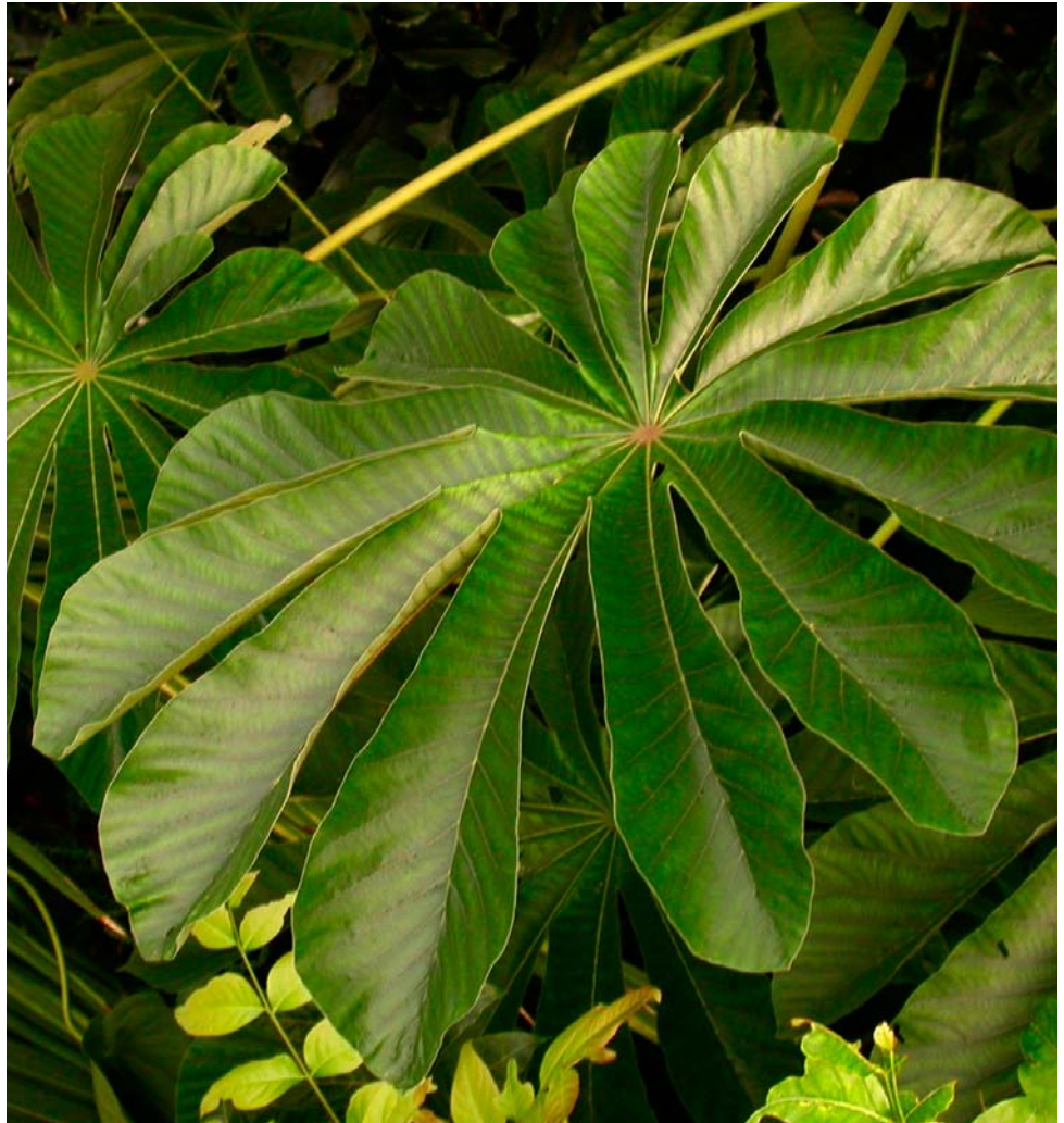
Cecropia is a distinctive weed, with very large soft leaves.

In its native range in the neotropics, Cecropia is the main genus of trees that colonises rainforest clearings, roadsides and other sites of disturbance. A single tree can produce millions of seeds annually, which are spread widely by birds and mammals that eat the sweet, many-seeded fruits.