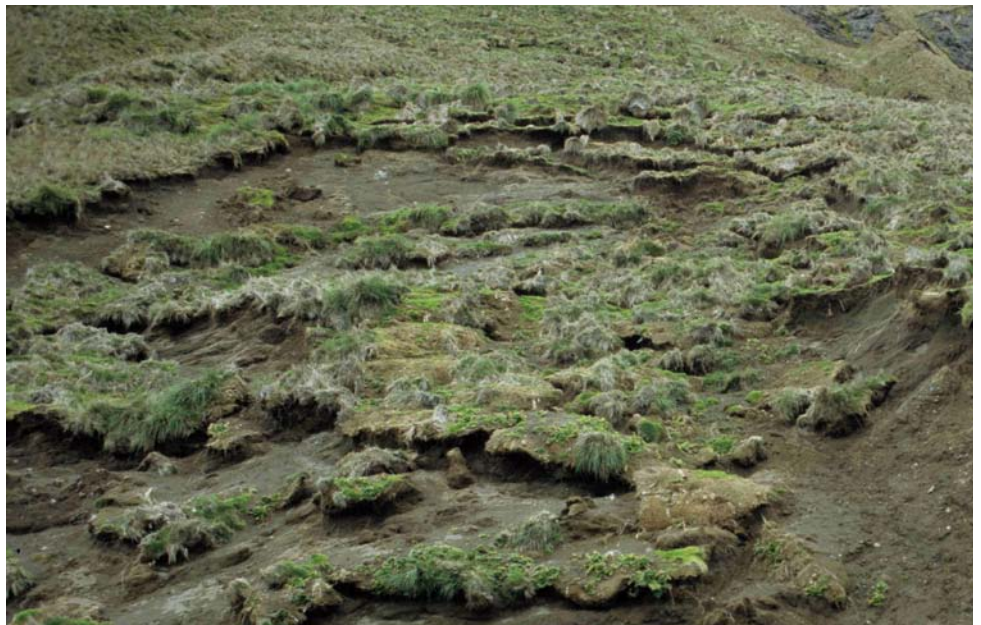
Rabbit damage of native vegetation on Macquarie Island.

A Federal Government review of the program in 2010 concluded that the benefits of eradicating rabbits and rodents would