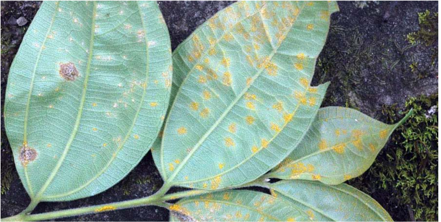
Murrtle rust infection on scrub turpentine ( Rhodamnia rubescens ).