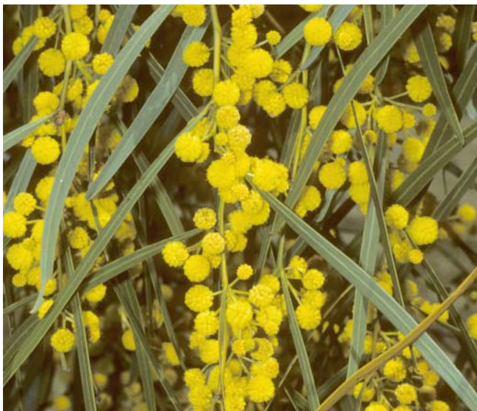
Golden wreath wattle ( Acacia saligna ) from Western Australia has become a weed all over the world, and especially in Africa.

Tim's article followed from an invitation to attend a conference in South Africa last October on weedy Australian acacias. Several Australian acacias have become major weeds in South Africa and elsewhere (including Acacia cyclops , A. mearnsii , A. melanoxylon , A. saligna ), yet Australian acacias continue to be widely promoted around the world for agroforestry.