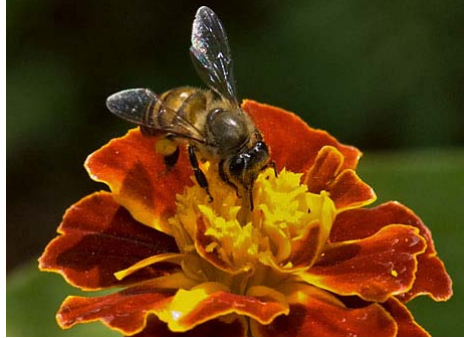
Asian honeybees are smaller than honeybees but look similar.

After a couple of years a cost-sharing agreement was finally agreed upon but on 31 January this year, before many funds from outside Queensland were forthcoming, the controversial decision was made that eradication was impossible. This brought strong criticism from the honeybee industry and from Senator Milne, and on 3 March this year ISC was again invited by the