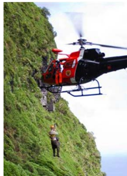
LHIB bush regenerator John Trehy getting winched into the cherry guava hotspot on the north-west face of Mt Gower by Park Air. To access the site on foot is a 3 hour one way hike. Heli-access means fresh legs and more weeds controlled each day.