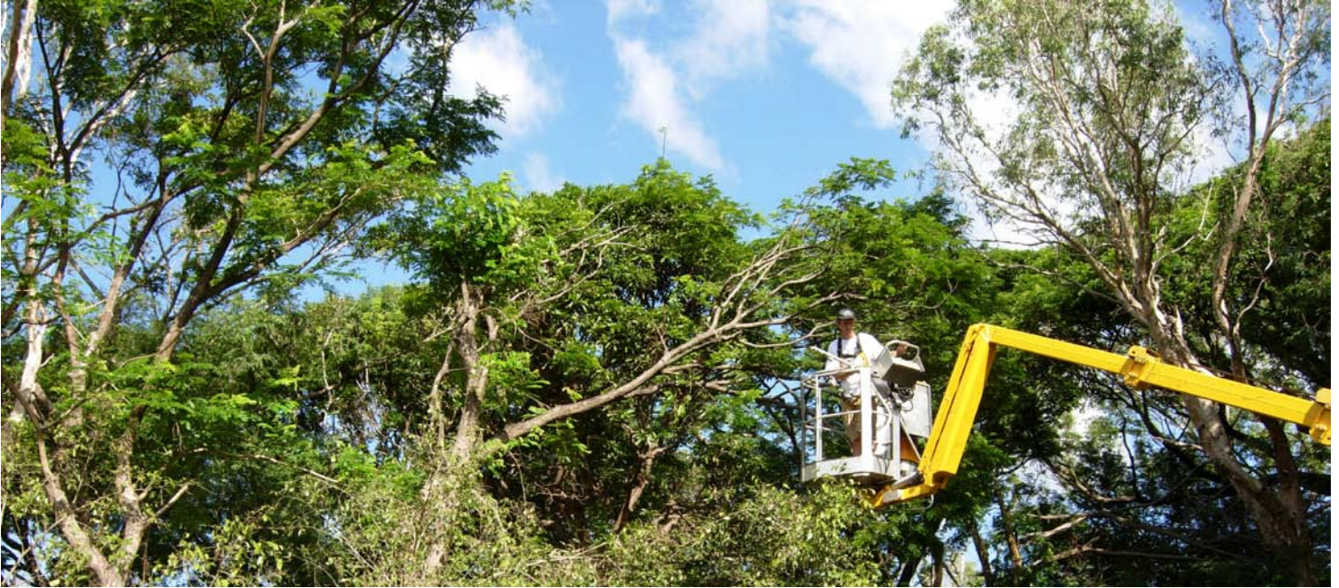
A basket crane was needed to catch the iguana high up a tree.