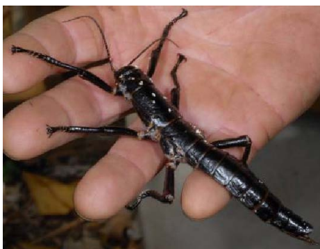
Lord Howe Island phasmid ( Dryococelus australis ). Rodent eradication will enable this unique insect and other species to be repatriated back to the main island.

LHI Marine Park consists of state and marine waters which together cover 300,510 hectares - the largest marine protected area in NSW. The marine environment is in a very fortunate position. Annual monitoring