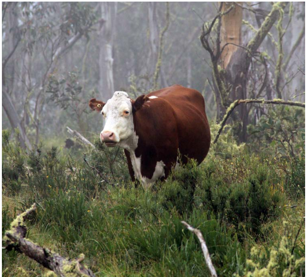
Cattle cause considerable damage in fragile alpine areas, including being a vector for spreading weeds.

Passage through animals: A variable proportion of seeds eaten by cattle survive passage through the gut and are viable when deposited within faeces, a source of nutrients and water for germination. Most studies show that most seed is defecated within about 30 to 70 hours but the last of it may take more than 10 days. A 1992 meta-