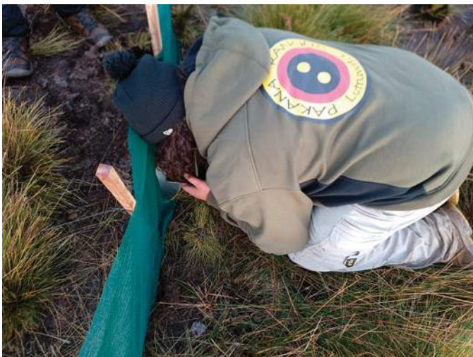
Islands offer a real chance of success at invasive species eradication, like eradicating feral cats from Lungtalanana/Clark Island.