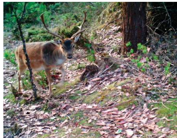
Feral deer in Tasmania.

'When you add up the costs to farmers and forestry, as well as the road toll and environmental damage, it's clear protecting feral deer is costing Tasmanians millions. It's time for a big rethink.'