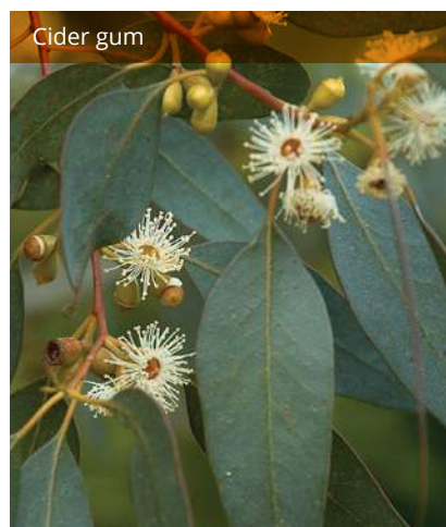
Cider gum As browsers, feral deer are a major source of tree mortality, threatening some populations of trees.