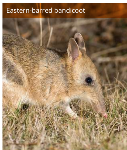
Eastern-barred bandicoot Feral cats predation is a key threat to the fragmented populations of eastern-barred bandicoot.