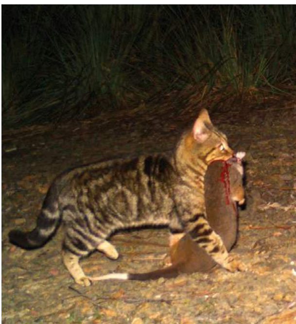
Ring tailed possum killed by feral cat. Credit: Barry Brook