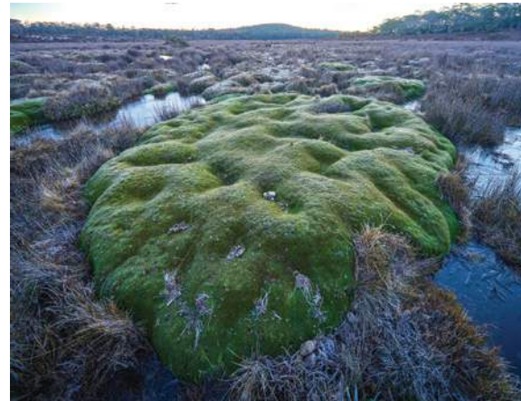
The Tasmanian Wilderness Heritage Area, home to fragile cushion plants and peatlands, is no place for feral deer.