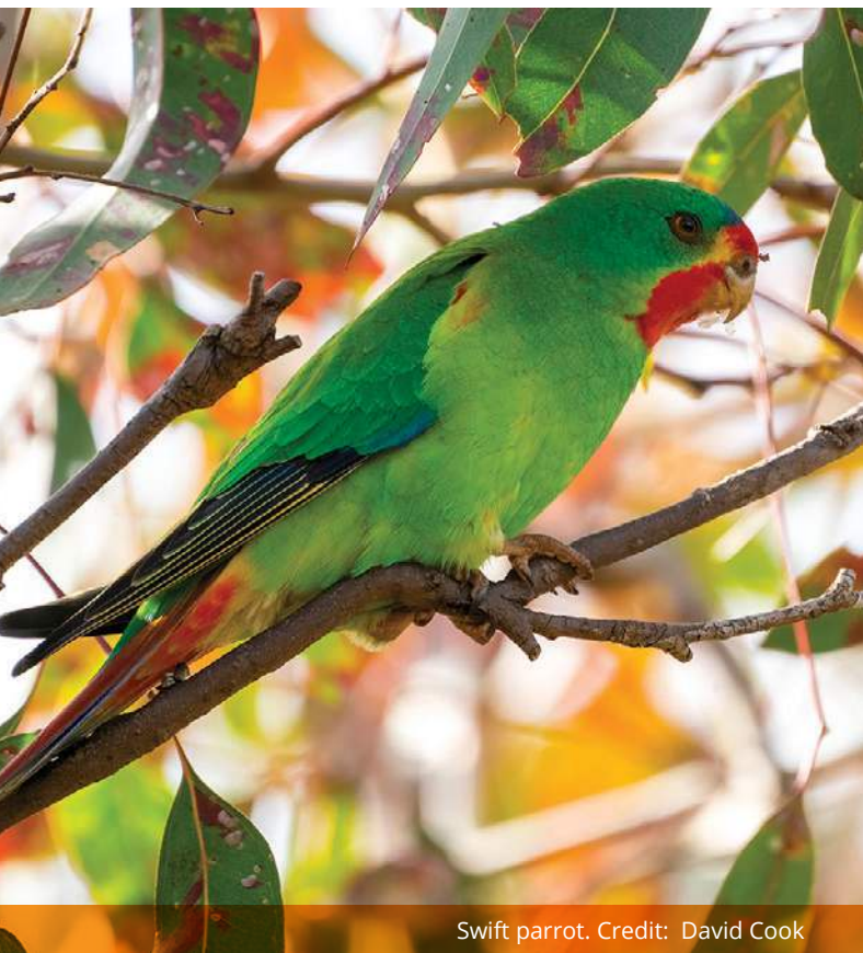
Swift parrot.

Invasive species also reduce farming production, prevent natural regeneration of bushland, and are an increasing threat to human lives on our roads. They cost Tasmania hundreds of millions of dollars each year in lost agricultural productions, increased insurance and management costs.