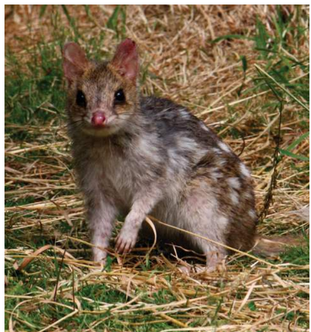
Feral cats threatened Tasmania threatened mammals including eastern quolls.