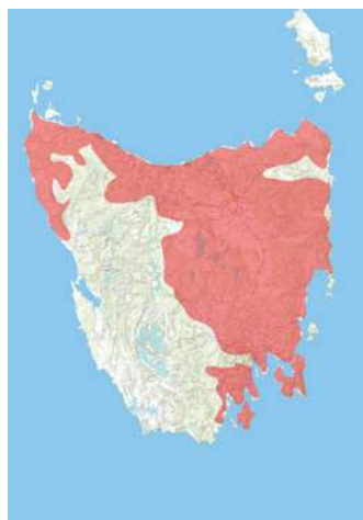
Possible distribution of feral deer based on habitat and climactic suitability based on data from Cunningham et al. 2022.