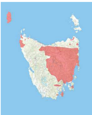
Estimated 2023 distribution of feral deer in Tasmania. Data from the Tasmanian Fallow Deer Management Plan and Natural Values Atlas.