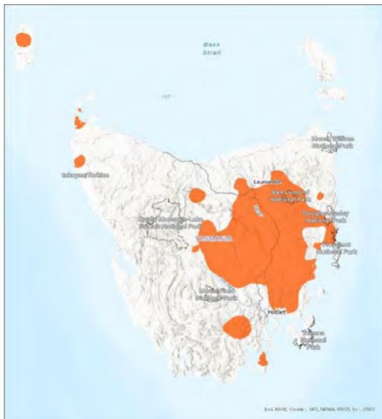
Current estimate of the distribution of Feral Deer

Deer have expanded beyond their 'traditional' range in the Midlands, including into the Tasmanian Wilderness World Heritage Area. There are several other satellite deer populations that have established outside the 'traditional' deer range as a result of deer farm escapes and intentional releases [3]. These include populations on the Tasman Peninsula, Bruny Island, Freycinet National Park, near Temma, and south of Hobart. Despite some efforts, no satellite herds have been eradicated and there are limited active local eradication programs presently occurring.