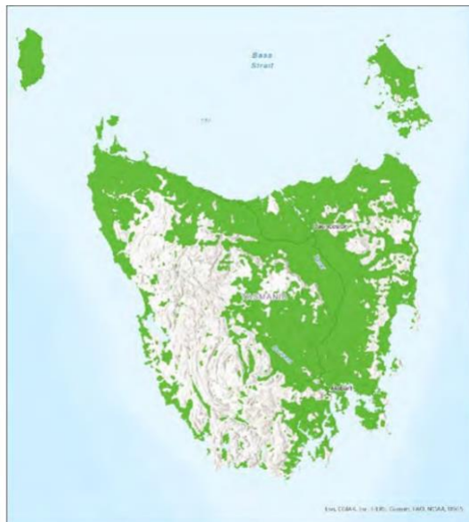
Potential occupation of fallow deer in Tasmania based on suitable climate and habitat 1 .