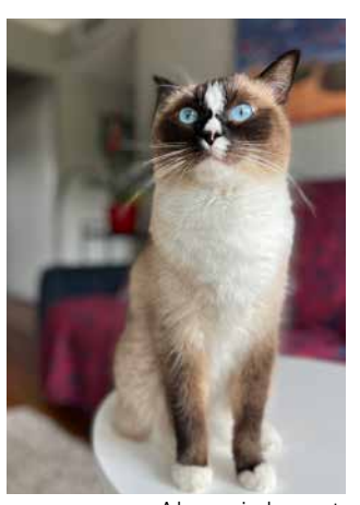
A happy indoor cat.

On average, each roaming, hunting pet cat kills more than three animals every week. The numbers add up. On average, over a year each roaming and hunting pet cat in Australia kills 186 animals. This number includes 110 native animals (40 reptiles, 38 birds and 32 mammals).