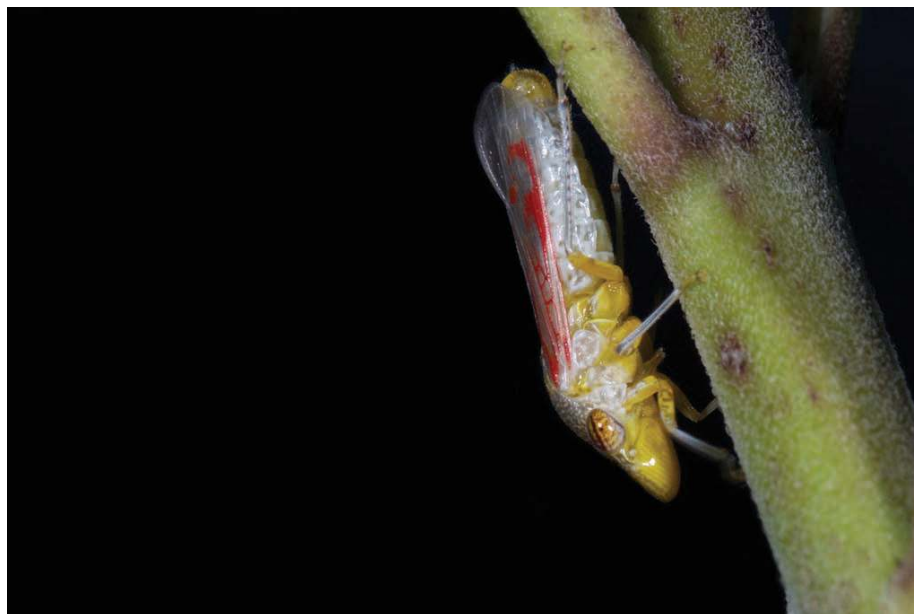
Glassy-winged sharp shooter.

If the sharpshooter reaches Australia, it is not expected to reach the extreme densities seen in French Polynesia, which reflect island ecosystems with few predators, parasites and competitors. The sharpshooter will be most serious as a threat to biodiversity if Xylella fastidiosa is also introduced.