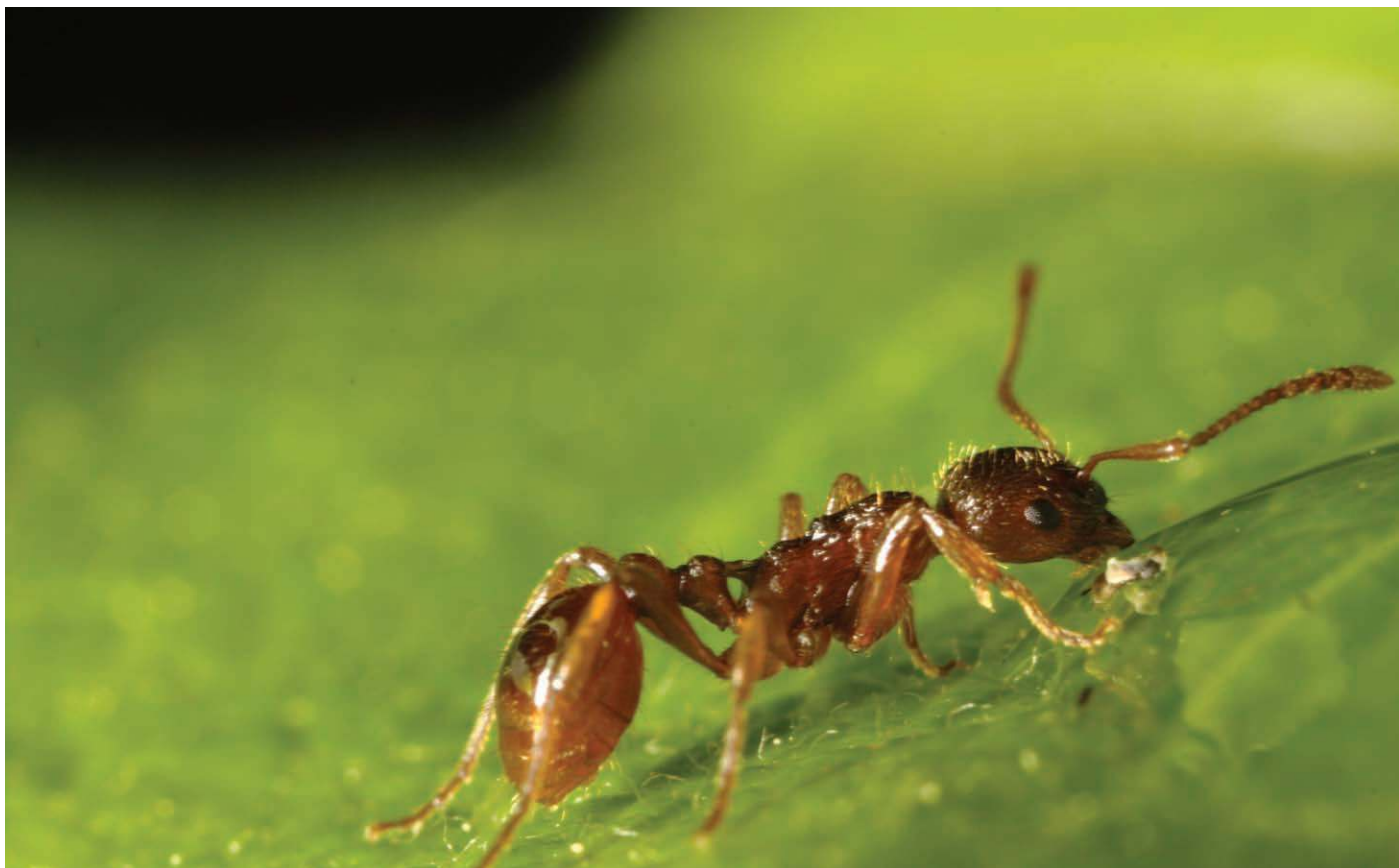
European fire ant.

Nests can be as dense as four per square metre of city back yard, making it impossible to stand on grass 11 . Yard and garden work is made difficult, and pets are distressed 3 . Parks and campgrounds can be rendered unusable 11 . By one estimate, the ants will cost British Columbia $100 million a year if they achieve their potential distribution 3 .