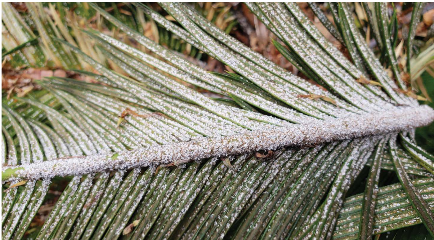
Cycad scale on sago palm leaf.

species are listed as threatened in Queensland and New South Wales. The cycad aulacaspis scale could cause extinctions even without killing plants if it sends populations into permanent decline by reducing their seed output and seedling vigour. In Florida, one of the cultivated cycads attacked by the scale is an Australian species ( Cycas media ) 8 .