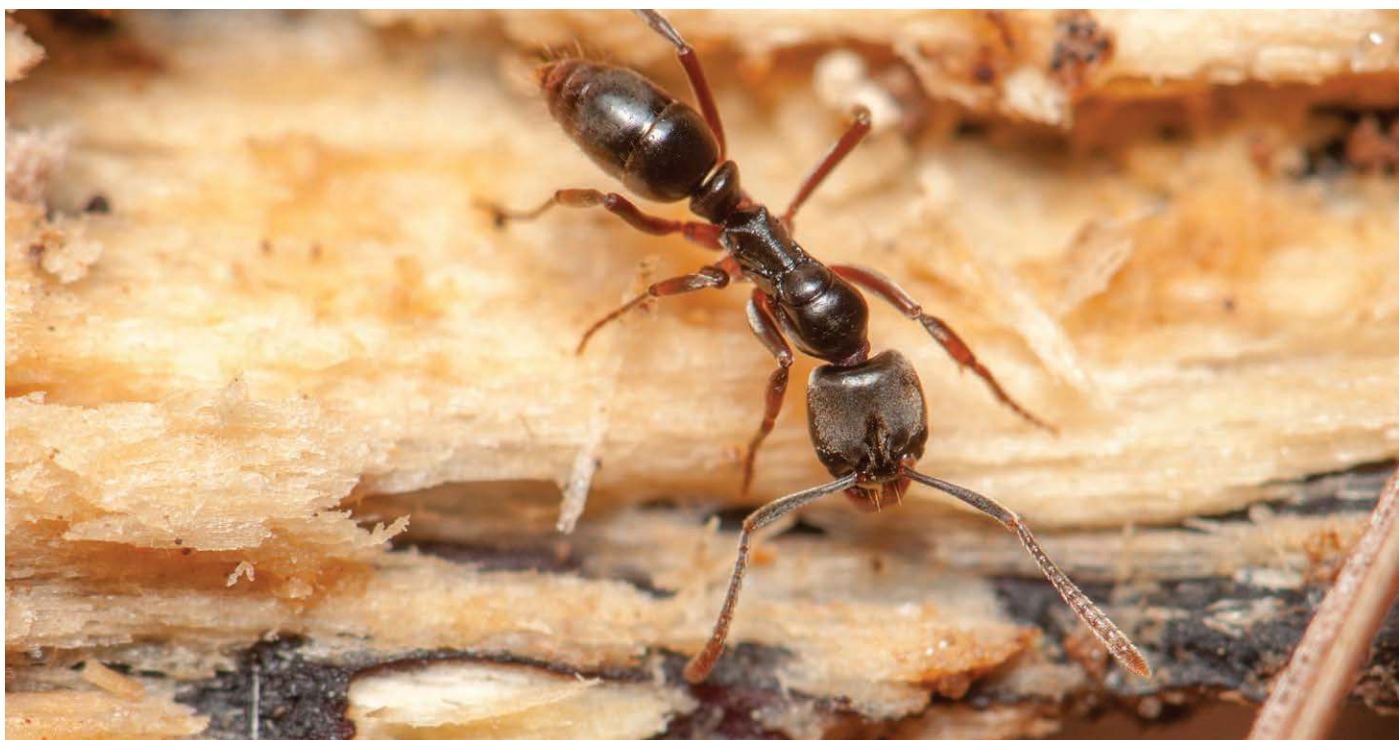
Asian needle ant.

urticaria, respiratory distress, wheezing and hypotension with or without loss of consciousness 6 . Some health problems attributed to fire ants in the United States may be due to Asian needle ants, which have received far less publicity 1 .