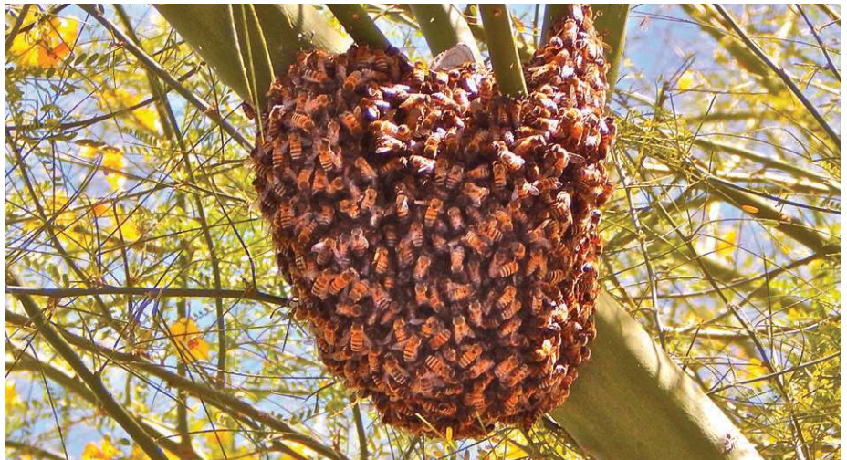
Africanised honey bee colony.

Africanised honey bees compete with endangered Neotropical parrots for nest holes 6 . They are considered one of the main threats to the survival of the nearly extinct Spix macaw 6 . When nest boxes