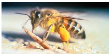
Africanised honey bee.

were installed in south-eastern Brazil to encourage nesting by endangered vinaceous-breasted Amazons, three of four boxes were taken over by Africanised honey bees 6 . At a breeding facility in Sao Paula, five blue-and-yellow macaws were killed and three red-and-green macaws were stung badly in an unprovoked attack by honey bees 7 . These attacks, and attacks documented on cattle 8 and fatal attacks on people 9 , imply that free-living wild animals are sometimes killed.