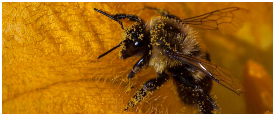
The common eastern bumblebee has been introduced into new areas as a horticultural pollinator. Here is one on a squash flower.

ecological harm elsewhere in the world, providing further reasons for concern about any bumblebee introductions. In Chile and Argentina, the Patagonian bumblebee ( Bombus dahlbomii ) has been listed as endangered, following displacement from much of its range by two species of bumblebee imported as pollinators, which compete with this species and infect it with a pathogen 16 . In Japan, large earth bumblebees now outnumber native bumblebees in some settings, and are blamed for a decline in one native species ( B. hypocrita sapporoensis ) 17 .