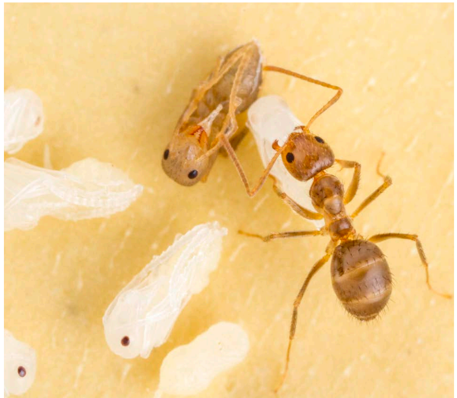
Tawny crazy ant pupae and worker.

The tawny crazy ant displaces other ants – in Colombia it displaces 9 of 14 native species 1 and in colonised sites in Texas it has attained within a year 'densities up to 2 orders of magnitude greater than the combined abundance of all other ants' 4 . In some locations in the United States, it is replacing (in much higher densities) the invasive red imported fire ant ( Solenopsis invicta ) 4 . It can outcompete the fire ant by capturing more prey and is able to detoxify the fire ant venom 1 . Fire ants in the United States are considered a very serious problem for biodiversity, for their attacks on invertebrates, reptiles and ground-nesting birds 5 , and the concern is that tawny crazy ants, a far newer arrival in the United States, could rival or exceed them as a threat 1 . Fire ants are restricted to disturbed habitats, while tawny crazy