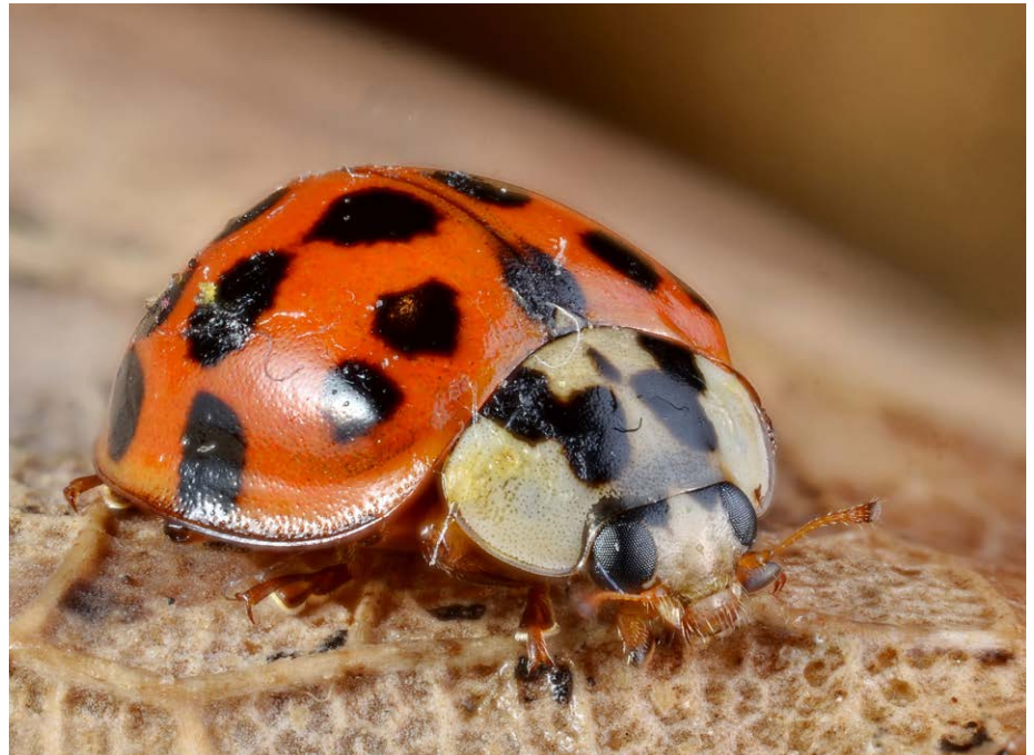
The harlequin ladybird.

The harlequin ladybird has been described by biologists as 'perhaps the most infamous of invasive insects in the twenty-first century' 4 . In many parts of North America and Western Europe it is now the most abundant ladybird 4 . The adults and larvae are voracious predators – typically eating 15 to 65 aphids a day – and they compete with and prey on other aphid predators ('intraguild predation'), especially native ladybirds 1,5 . The large larvae are particularly aggressive predators of the eggs and larvae of other aphid predators, and all life stages appear to have superior physical and chemical defences against counter-attacks by these predators 6,7 .