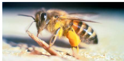
Africanised honey bee.

were installed in south-eastern Brazil to encourage nesting by endangered vinaceous-breasted Amazons, three of four boxes were taken over by Africanised honey bees 6 . At a breeding facility in Sao Paula, five blue-and-yellow macaws were killed and three red-and-green macaws were stung badly in an unprovoked attack by honey bees 7 . These attacks, and attacks documented on cattle 8 and fatal attacks on people 9 , imply that free-living wild animals are sometimes killed.