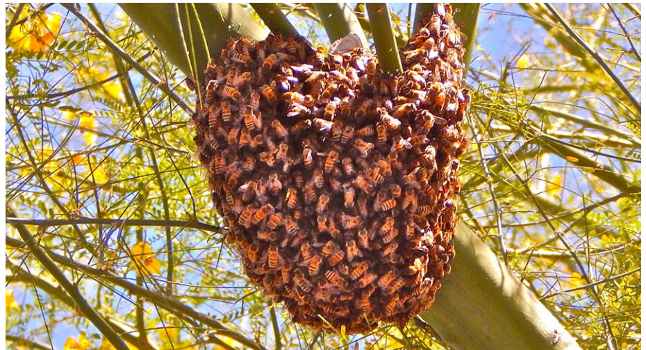
Africanised honey bee colony.

Africanised honey bees compete with endangered Neotropical parrots for nest holes 6 . They are considered one of the main threats to the survival of the nearly extinct Spix macaw 6 . When nest boxes