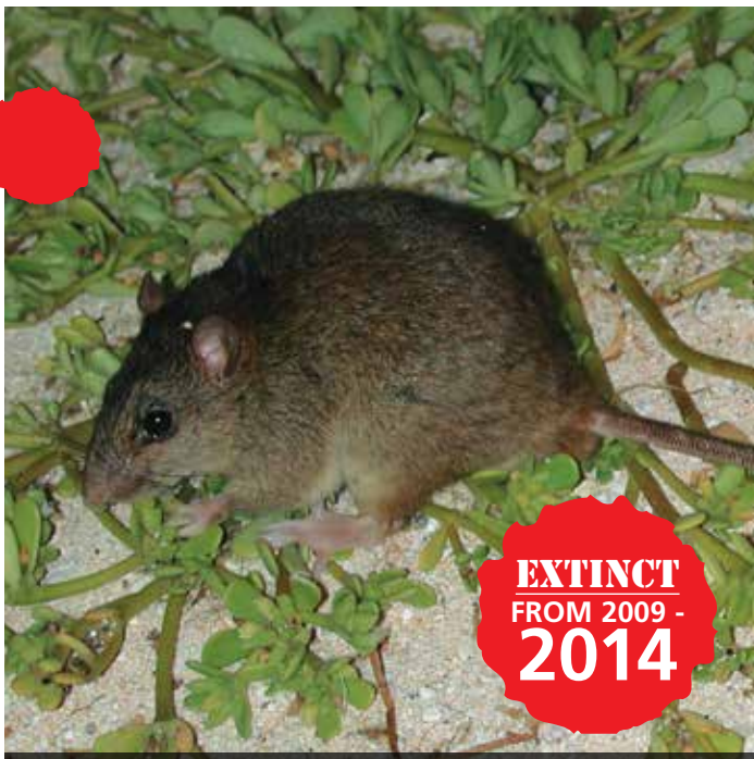
Bramble Cay melomys ( Melomys rubicola ).