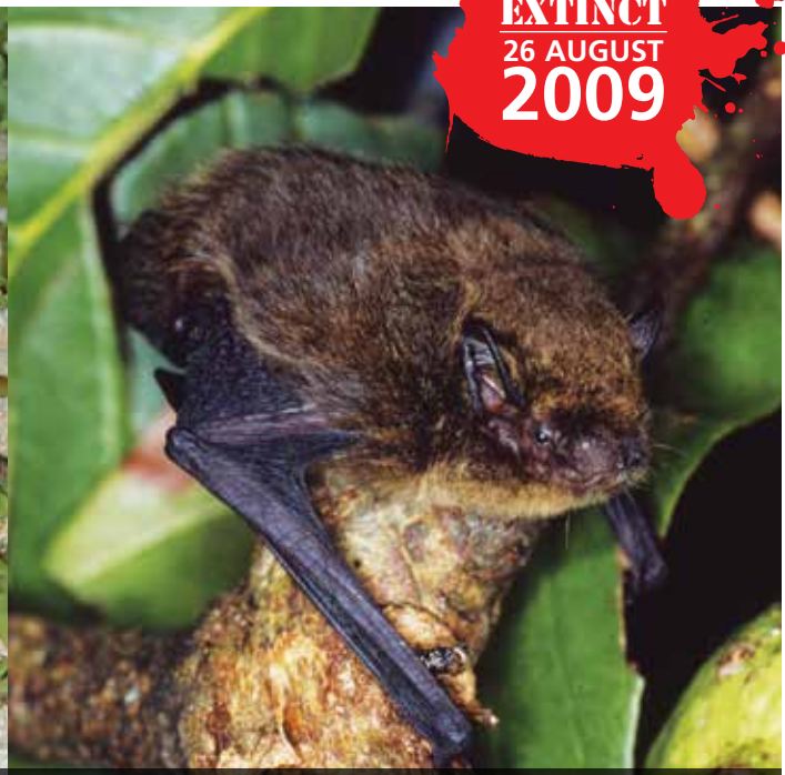
Christmas Island pipistrelle ( Pipistrellus murrayi ).