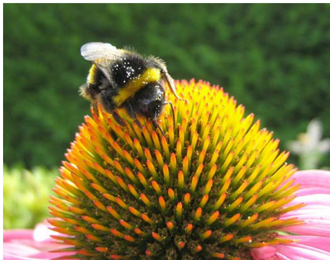
Bumblebees have been viewed as an invasive species wherever they have been introduced.