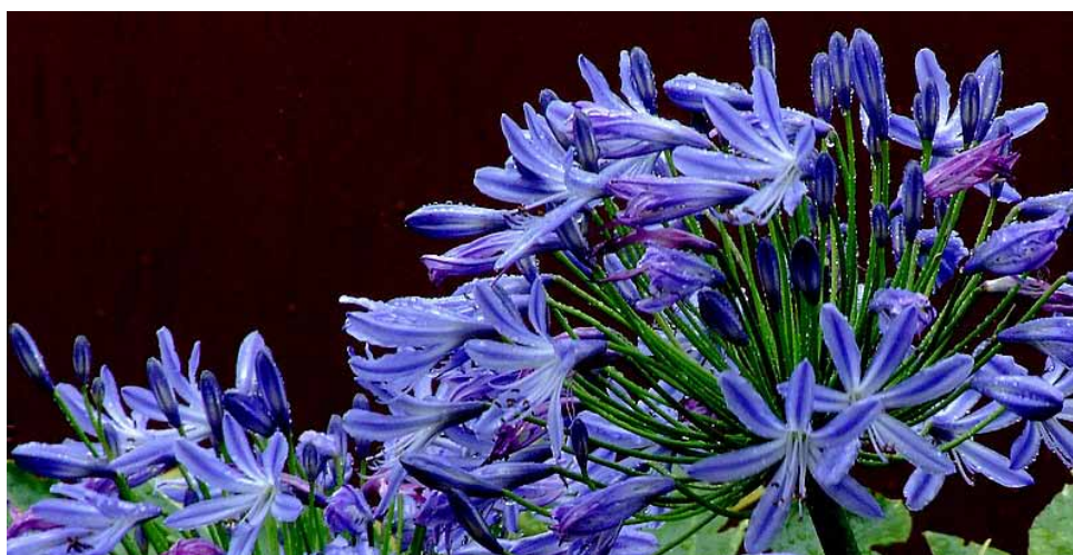
A popular garden ornamental plant agapanthus is also an environmental weed that poses significant threats to bushland areas.

The Hawke review has recommended that the Council of Australian Governments (COAG) address this problem, and suggested that a national controlled list