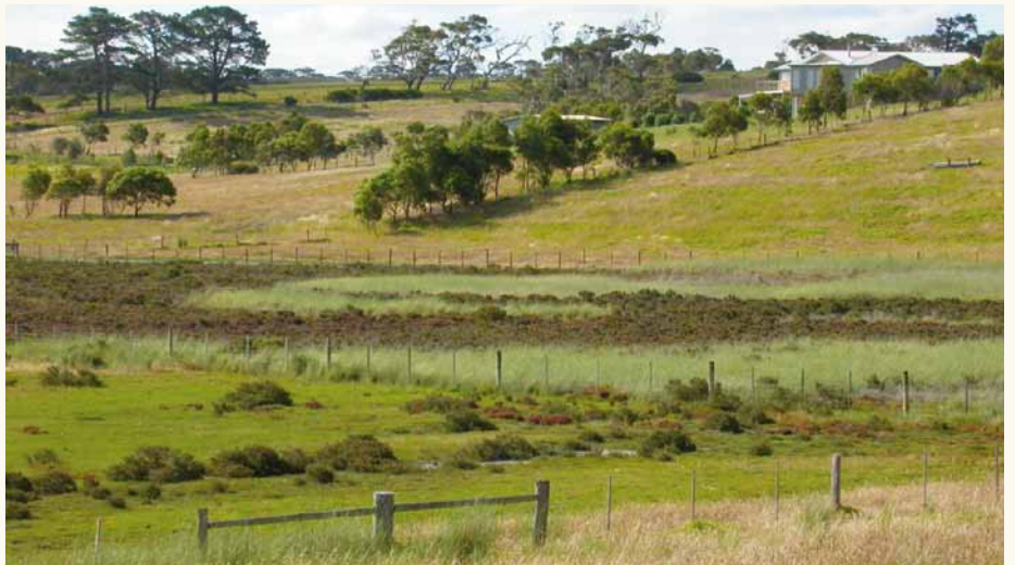
Tall Wheat Grass invading margins of saltmarsh in the estuary of the Barwon River at Ocean Grove in Victoria. This site is adjacent to Port Phillip Bay and the Bellarine Peninsula Ramsar site. It has probably been planted here (December 2007).

Tall Wheat Grass may help some graziers yield higher profits in the short-term, but the costs of its invasion will be