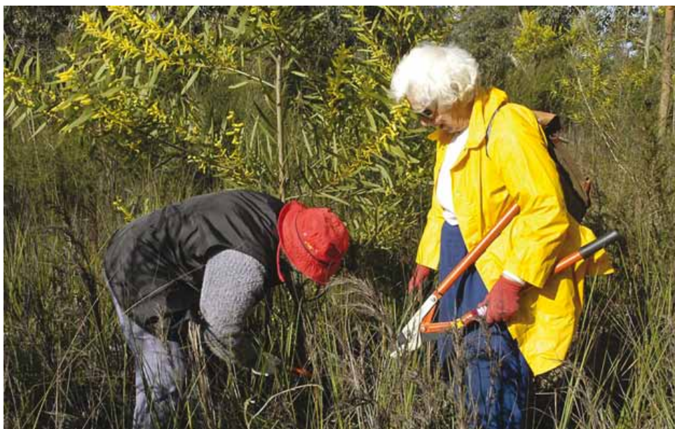
Volunteers already play an invaluable role in protecting the Australian landscape from invasive weeds. Here, volunteers with one of Victoria's 'Friends of' groups get down to business.

On the Warringah peninsula, for instance, Middle Creek between Oxford