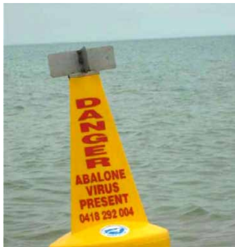
The Victorian Abalone Divers Association place these buoys in the water to mark areas of known virus infections.

The origins of the virus are unknown and contentious. The disease is similar to one recently recorded in Taiwan, but the Victorian Government says it is unlikely