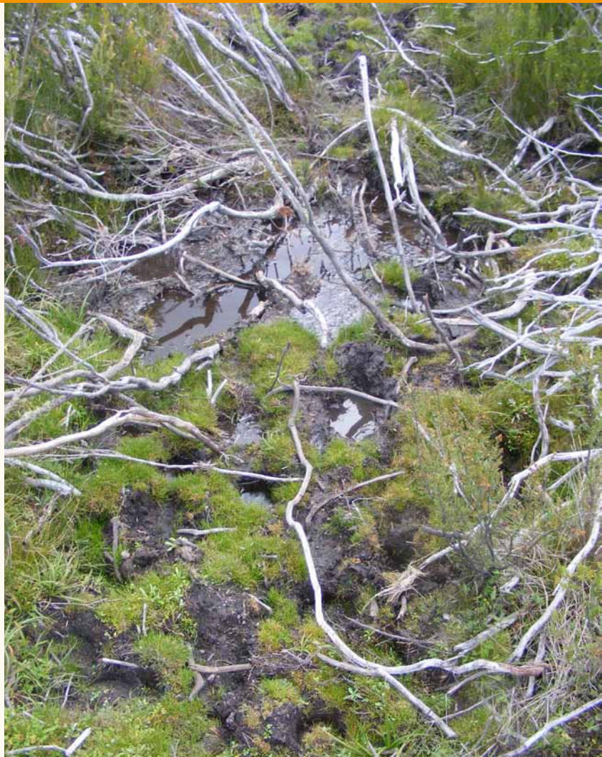
Horse damage to a sphagnum bog, part of an endangered ecological community.

It can be downloaded from http://www.australionalps.environment.gov.au/publications/research-reports/feral-horses-aerial-survey.html .