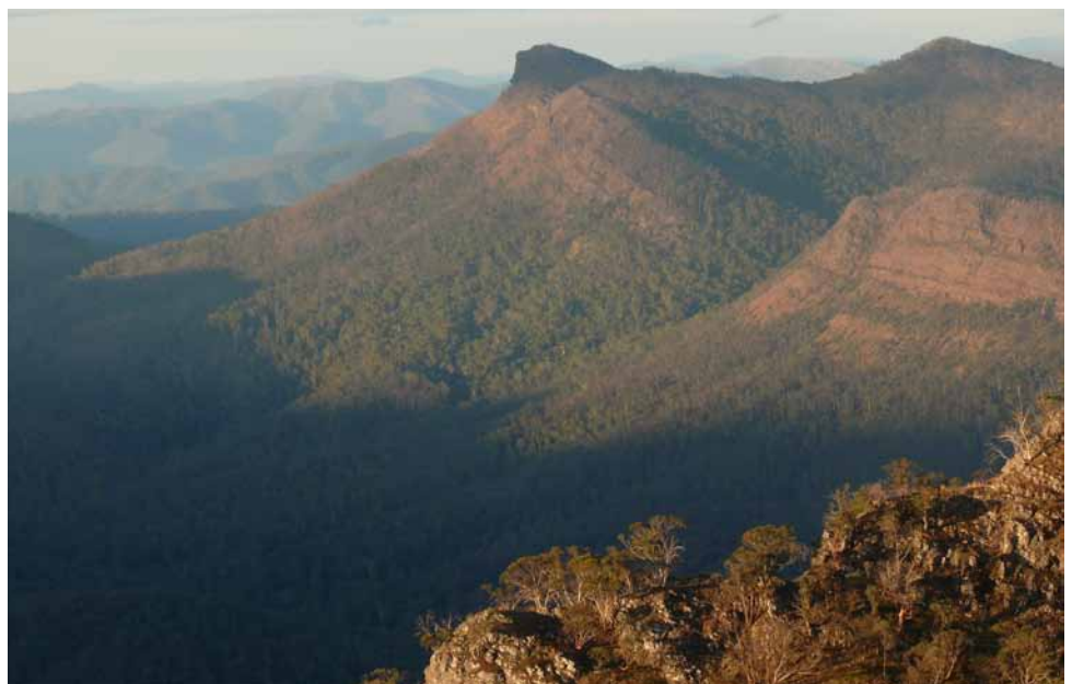
The Australian Alps stretch from Canberra in the Brindabella ranges, south through NSW to Victoria.

“They gallop freely through the trees that cover the slopes of Mount Moffatt, in central Queensland, ten of them, 20 even, manes flying, nostrils flaring, the rhythmic thrump,