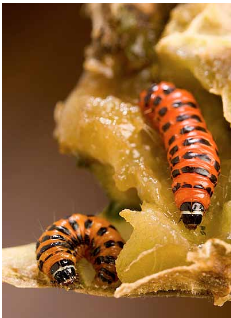
Cactoblastis cactorum , Australia's most successful biological control agent, which brought prickly pear under control.

Over the past 75 years, hundreds of non-native BCAs have been imported into Australia but only a small number have proved highly beneficial as many have failed