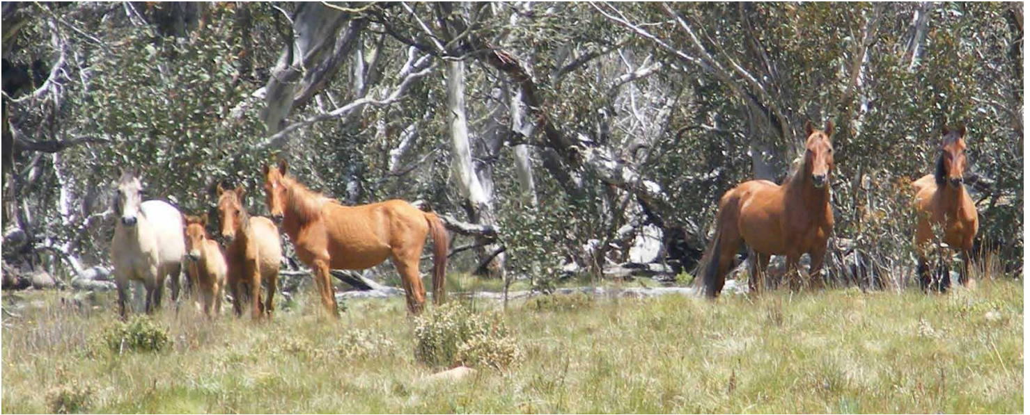
Feral horse numbers in the Australian Alps have tripled in the past six years.