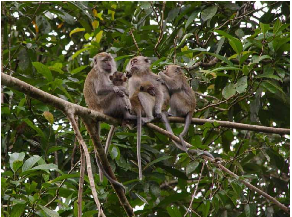
Long-tailed macaques eat widely, and are known to prey on eggs, chicks, lizards, crabs, seeds and fruit.

Under existing arrangements, the Federal