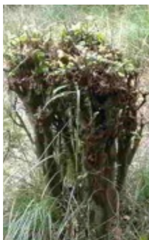
A fig tree grazed by deer (NSW).

The Victorian Government has so far failed in its