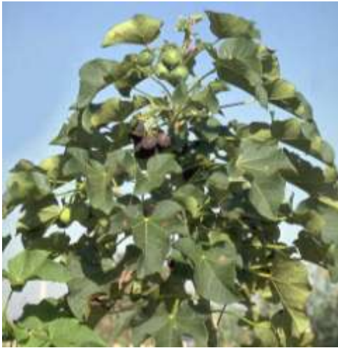
Jatropha ( Jatropha curcas )