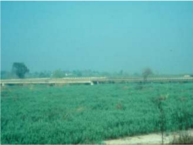
Giant reed ( Arundo donax ) invasion in California