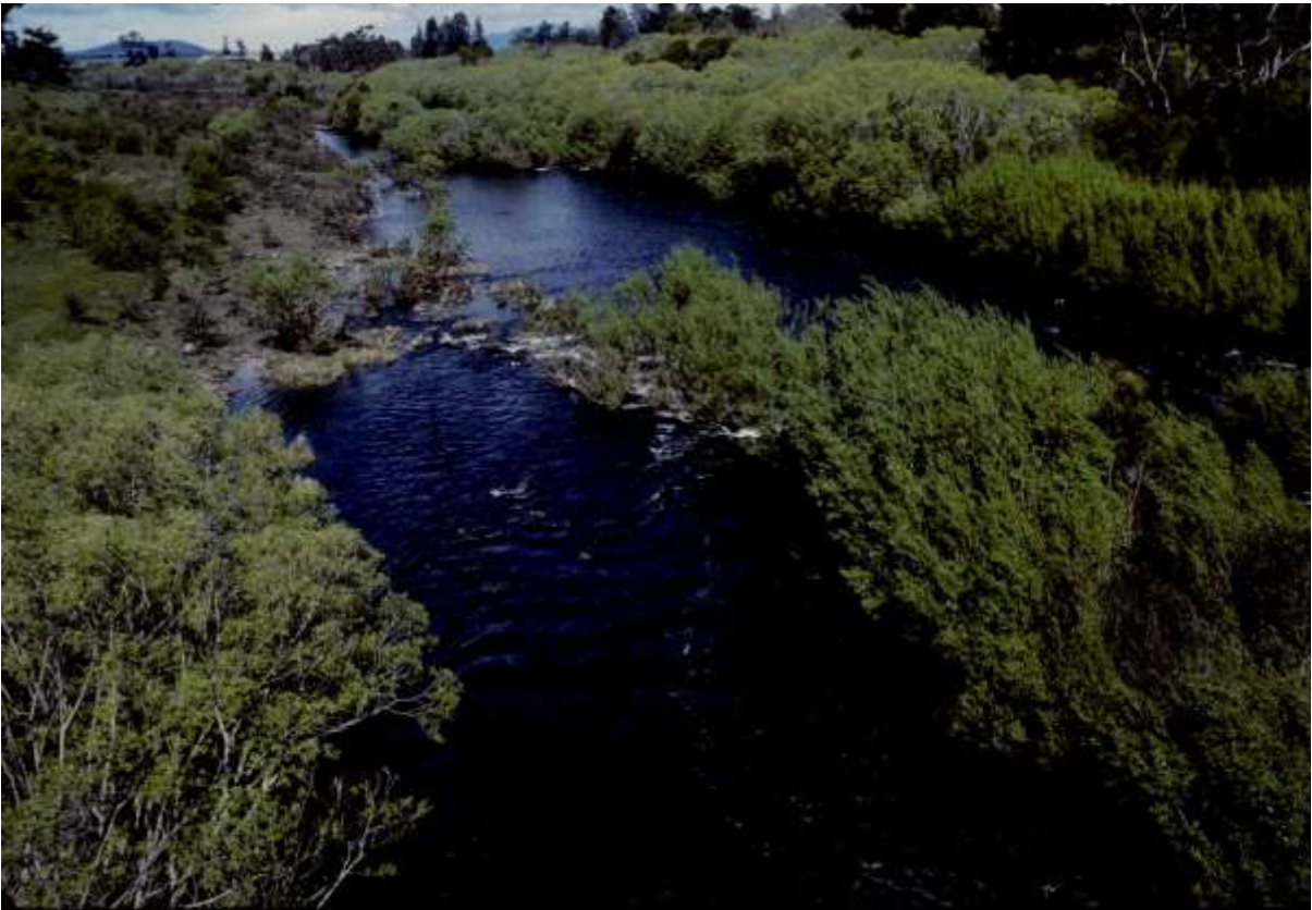
Willows ( Salix ) near Perth, Tasmania, completely dominating the river environment