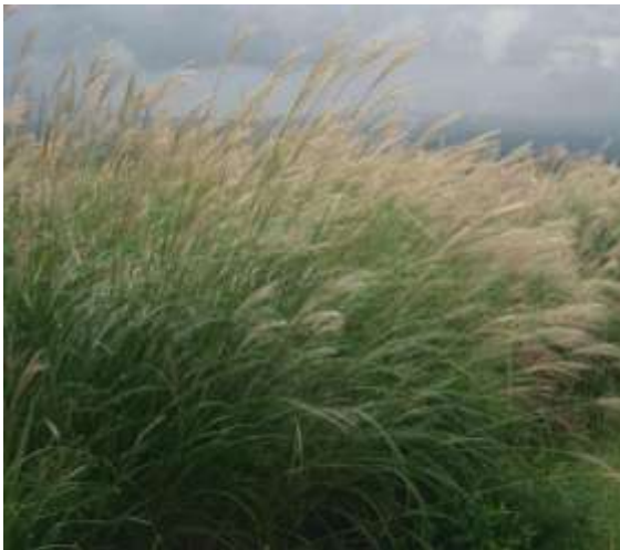
Miscanthus ( Miscanthus sinensis )