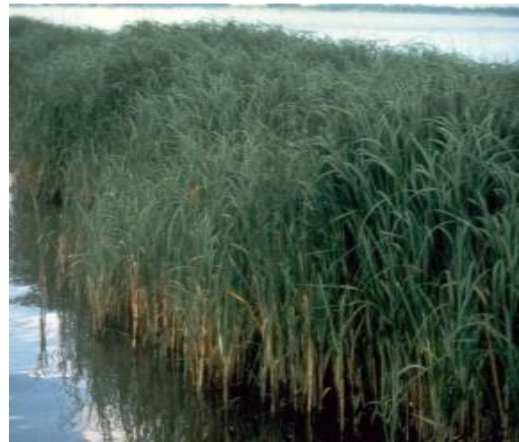
Spartina ( Spartina alterniflora )