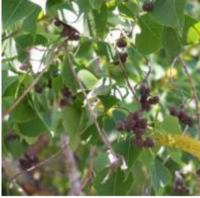
Chinese tallow ( Triadica sebifera )