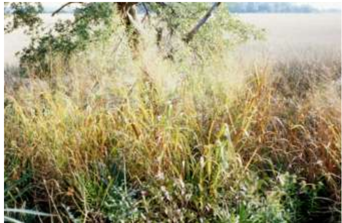
Switch grass ( Panicum virgatum )