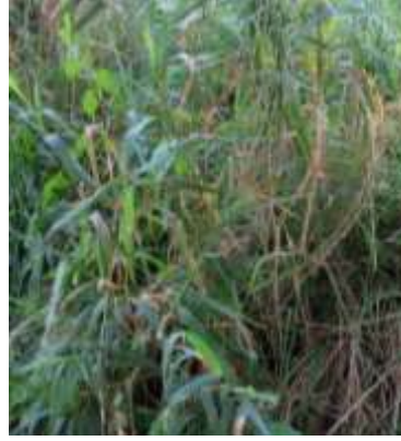
Reed canary grass ( Phalaris arundinacea )