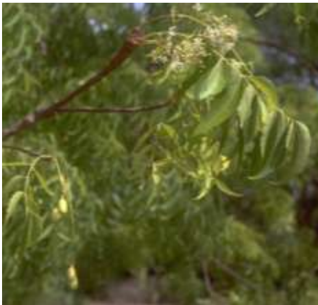
Neem tree ( Azadirachta indica )