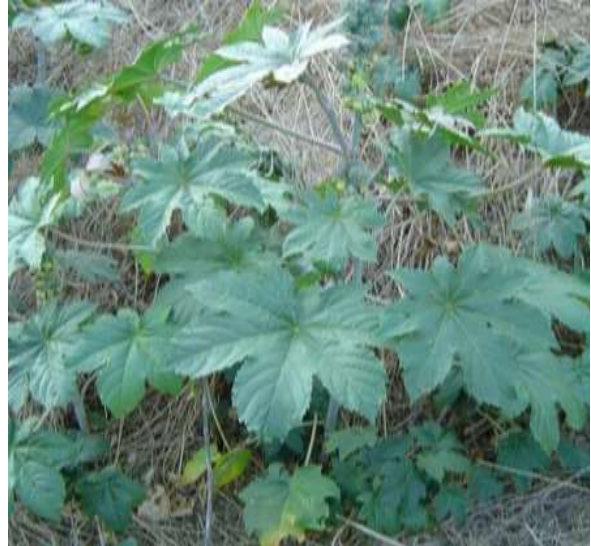
Castor oil plant ( Ricinis communis )