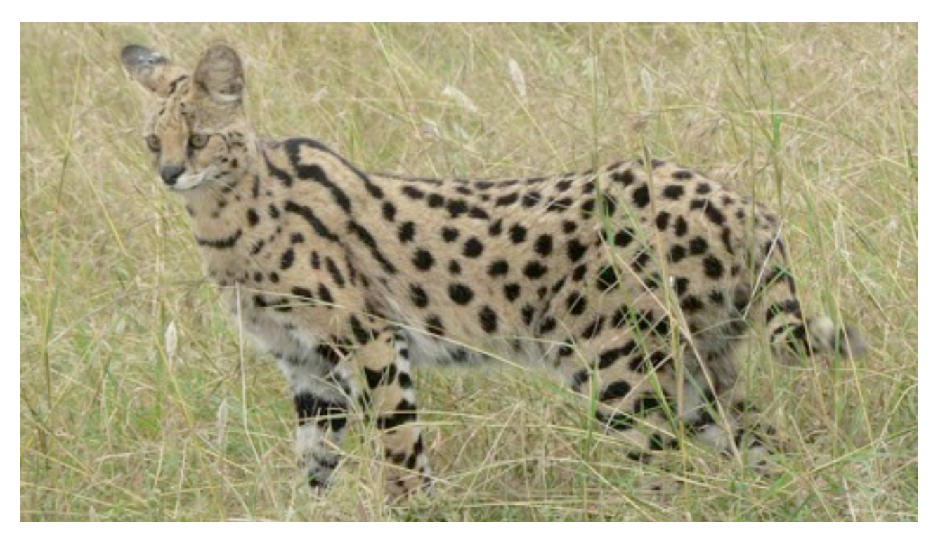
After a strong public outcry, the federal government has decided to ban the import of savannah cats.

In early August Environment Minister Peter Garrett decided that he would not allow the import of savannah cats, a hybrid of the domestic cat and African servals (a serval is shown above).