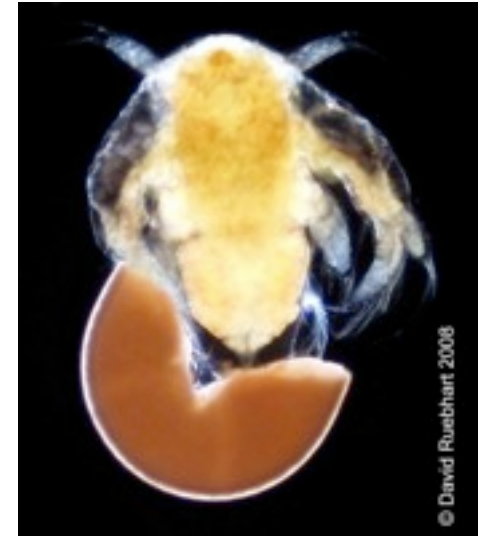
Emergence of A. franciscana nauplius

Ruebhart, D.R., Cock, I.E., Shaw, G.R. (2008). Invasive character of the brine shrimp Artemia franciscana Kellogg 1906 (Branchiopoda: Anostraca) and its potential impact on Australian inland hypersaline waters. Marine and Freshwater Research 59(7):587-595. http://www.publish.csiro.au/paper/MF07221.htm