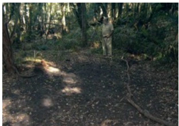
LEFT: A sambar wallow in salt marsh from Lake Tyers. RIGHT: A sambar rutting area, in alluvial terraces warm temperate rainforest from Lake Tyers. PREVIOUS PAGE: Failed gap regeneration and loss of littoral rainforest as a result of sambar damage

including songbird abundance and species composition, nest predation rates, the abundance and density of invertebrates, and the abundance and seed predation activity of small mammals." [The associated references have been removed from this quote.]