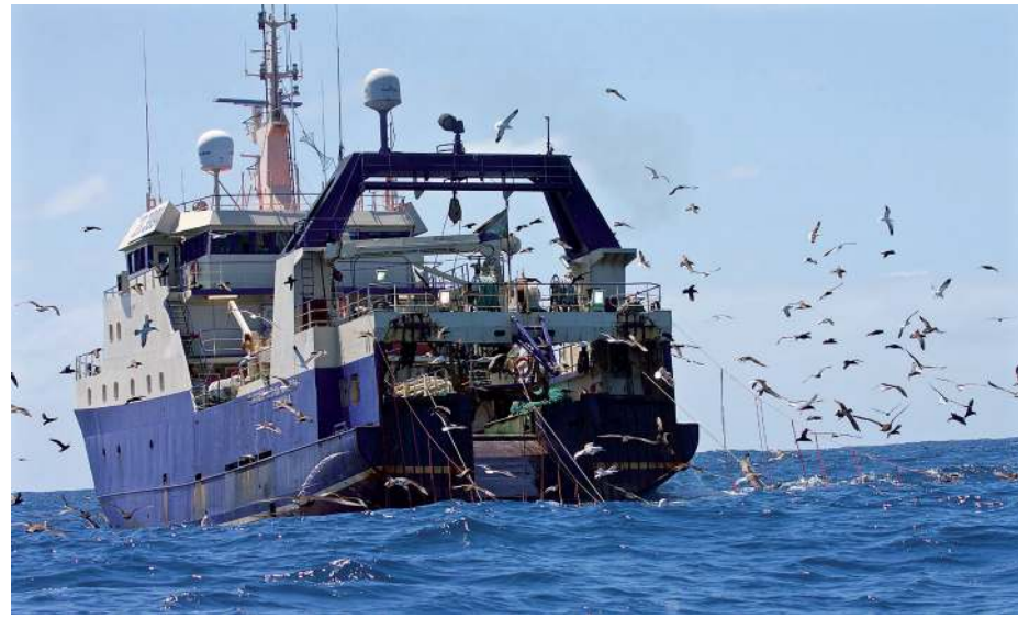
Albatrosses, petrels and other sea-birds swirl around a longline fishing vessel that has bird scaring lines hanging off the cables.

At least 30 seabird species in Australian