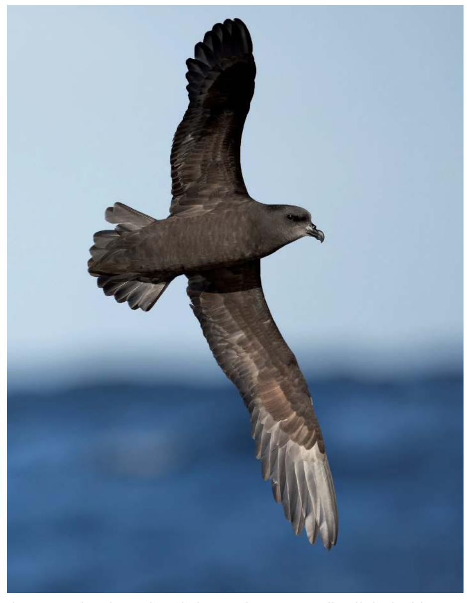
The great-winged petrel is one of 12 seabirds in Australian waters most affected by longline fishing.

Financial commitment: The Australian Government spent about $1–2 million over the 5 years to 2018 to implement the threat abatement plan and the fishing industry invested at least $0.5 million on research and development.<sup>10</sup>