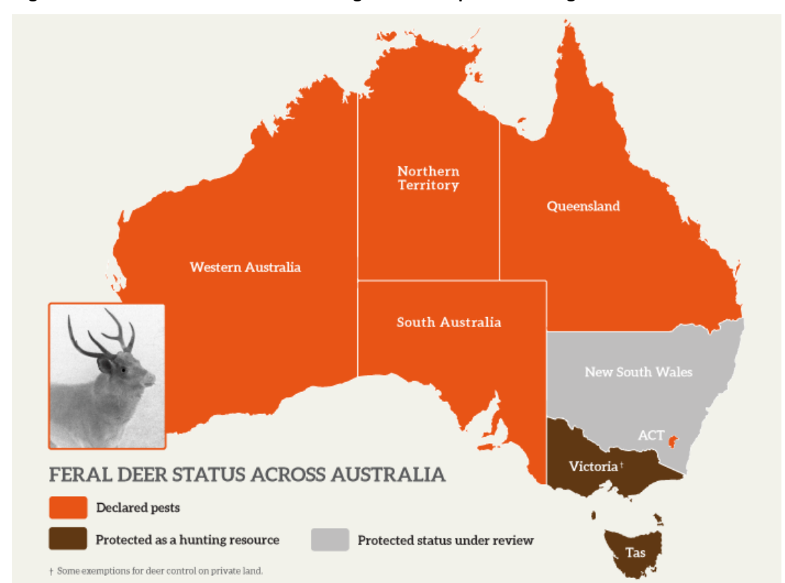
Figure 1: Status of deer in Australia showing anomalous protection as game in the South-East

We are aware that deer are not listed as pest animals in Victoria. The listing of deer as pest species and the removal of their protection as "game" would be key steps towards the control of these animals on Crown land. As the diagram below shows, deer are listed as pests across most of Australia (their protected status in NSW is under review given large impacts on the environment, national parks, farms, the economy, infrastructure and human life- deer have caused several road fatalities in NSW).