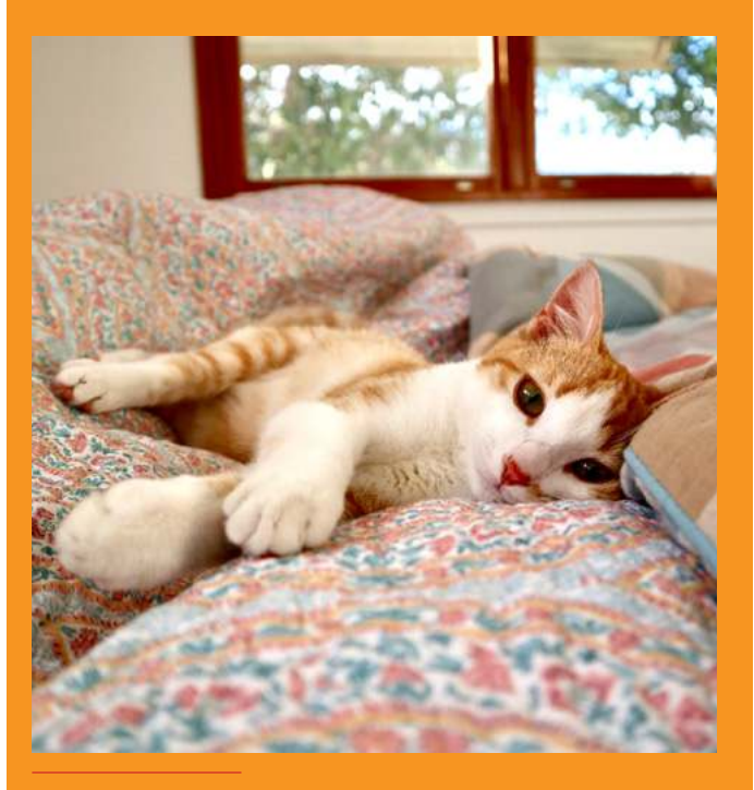
1 RSPCA Australia, www.safeandhappycats.com.au

Preventing pet cats from freely roaming not only helps reduce the impact on local biodiversity from hunting, but helps protect pets from contracting diseases, reduces their risk of becoming injured or killed through fighting and accidents, prevents accidental breeding, increases the opportunity for owner-animal interaction, minimises transmission of diseases like the zoonoses toxoplasmosis and reduces disturbance caused to neighbours by roaming pets<sup>1</sup>.