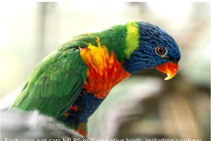
Each year pet cats kill 80 million native birds, including rainbow lorikeets.