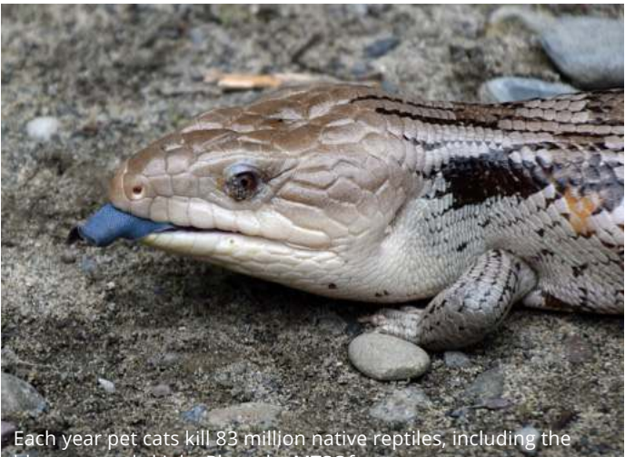
Each year pet cats kill 83 million native reptiles, including the blue-tongued skink.. Photo by MTSOfan