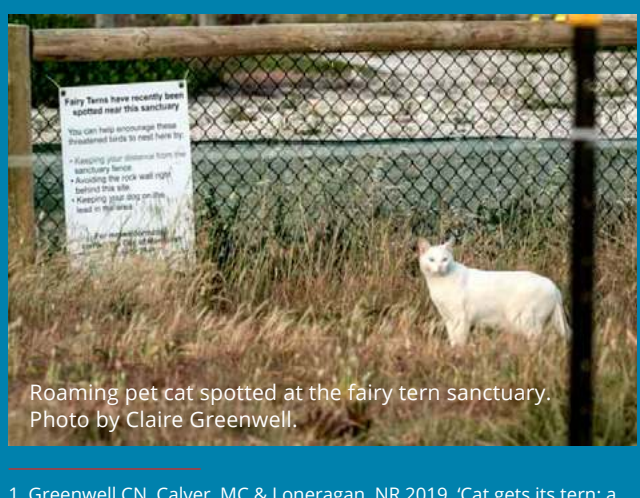
1 Greenwell,CN, Calver, MC & Loneragan, NR 2019, 'Cat gets its tern: a case study of predation on a threatened coastal seabird', Animals, vol. 8, pp. 445.

A single free-roaming cat can detrimentally affect sensitive species - not only through direct predation, but secondary effects. In Mandurah, Western Australia, one unregistered, desexed male cat entered a protected breeding colony of fairy terns. Over a period of three weeks, regular predation and disturbance by the cat caused the complete reproductive failure of all 111 nests; 6 adults and multiple chicks were directly killed and the remaining birds abandoned their nests. The presence of one cat meant the bird colony failed to produce a single chick that made it to the end of nesting season<sup>1</sup>.