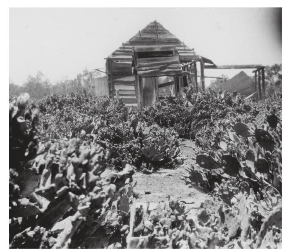
Prickly pear caused the abandonment of many farms. This home was in the Chinchilla district of Queensland.

In 1901, the Australian Government offered a reward of £5000 (about $800,000 in today's terms) to anyone who could come up with a solution. Six years later the reward was doubled, but none of the 600–700 proposals was considered practical.<sup>1</sup> Ideas included mustard gas, flamethrowers and introducing more rabbits.