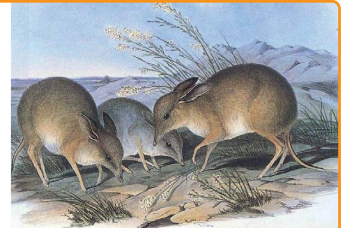
Pig Footed Bandicoot ( Chaeropus ecaudatus ).

2 endemic rodents on Christmas Island due to infection by a trypanosome blood parasite from introduced black rats.